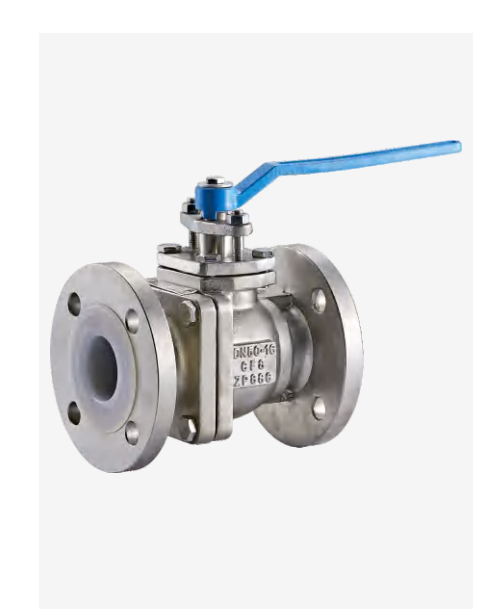
Lined GB National Standard Ball Valves