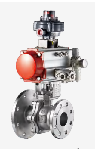
Pneumatic Vertical Stem Discharge Ball Valve (ZPR780F)