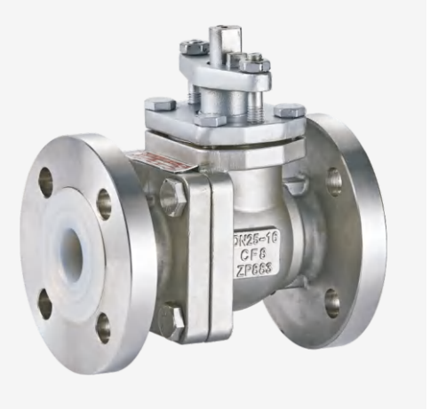
Lined Silica Sol Casting Ball Valve