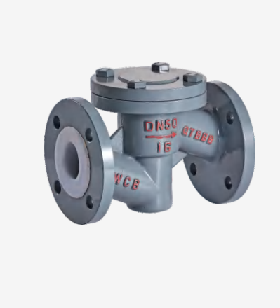
Fluorine-Lined Lift-Type Check Valve (H41)