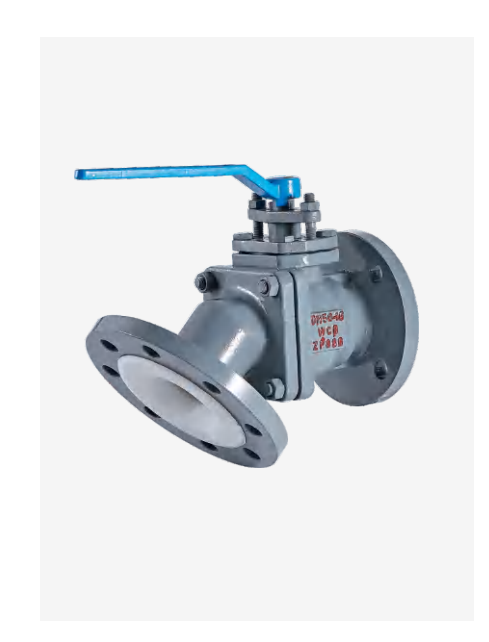
PTFE-Lined Diagonal Discharge Valve