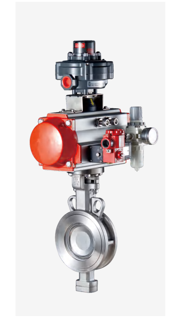
Pneumatic Metal-to-Metal Wafer Type Butterfly Valve(ZPR820Y)