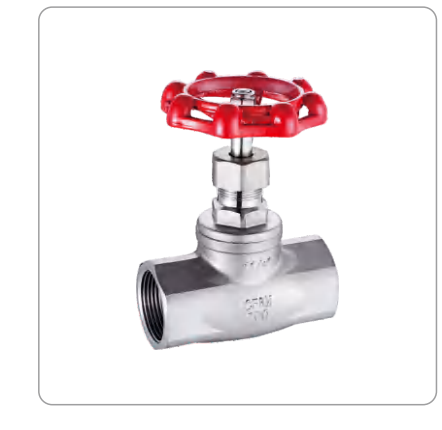
Thread Globe Valve