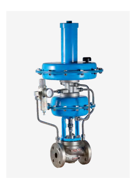
Self-Operated Micro-Pressure Regulator (Actuator Control) ZZYVP