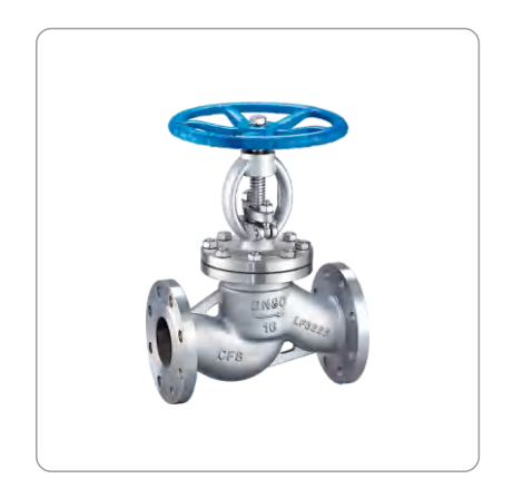
Flanged Globe Valve