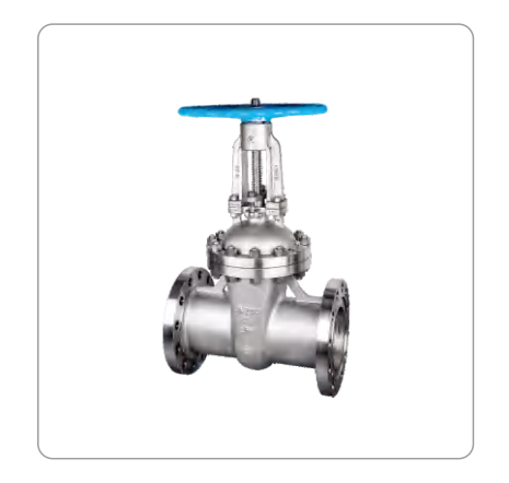
Flanged Gate Valve