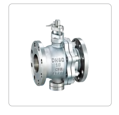
Flanged Trunnion Ball Valve