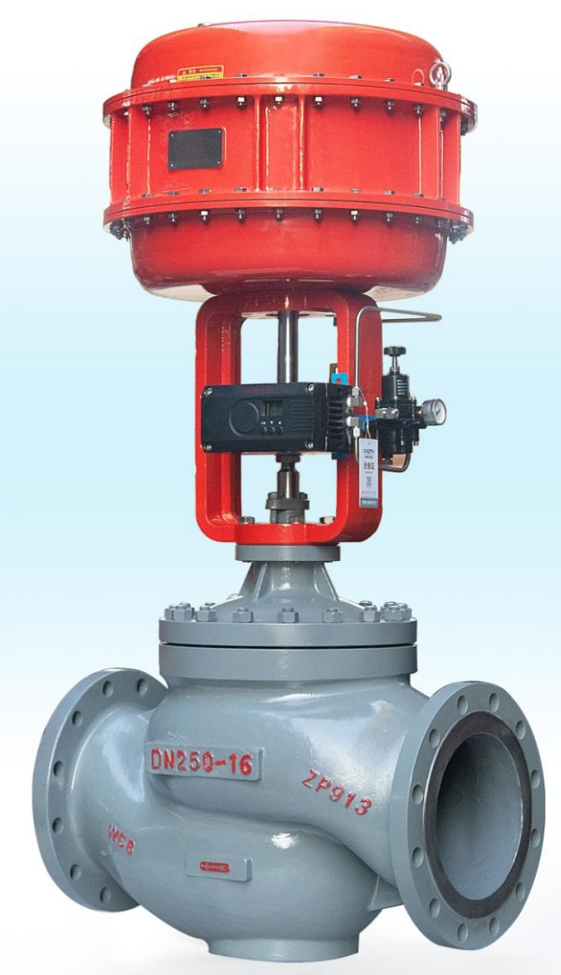
Pneumatic Sleeve-Guided Regulating Valve (ZP913)