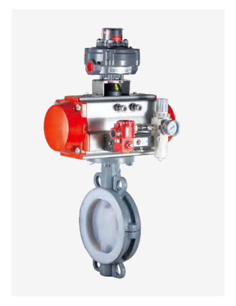
FEP-Lined Pneumatic Wafer Type Butterfly Valve(ZPR810F)