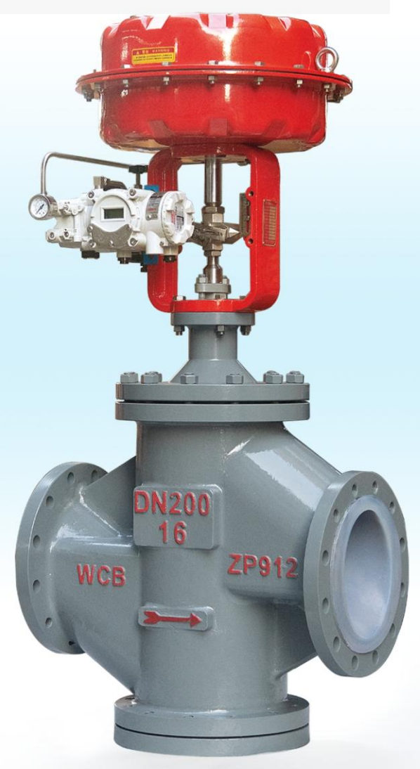
FEP-Lined Pneumatic Control Valve (ZPL510F)