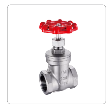
Thread Gate Valve