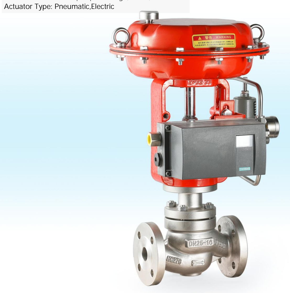
Pneumatic Hastelloy Alloy Regulating Valve (HC276)

Nominal Diameter: DN15-350, NPS 1/2"-14" Nominal Pressure: PN10-PN100, CL150-CL600 Connection Standard: HG20592-2009, ANSI B16.5 Body Material: TA2, HC276, Monel, Pure Nickel, 35581 Trims Material: TA2, HC276, Monel, Pure Nickel, 35581 Sealing Type: Soft-Sealing, Metal-to-Metal Bonnet Type: Standard, Extension, Bellows Sealing Temp. Range: -196°C-425°C(-320°F-797°F) Flow Characteristic: Equal percentage, Linear, On-Off