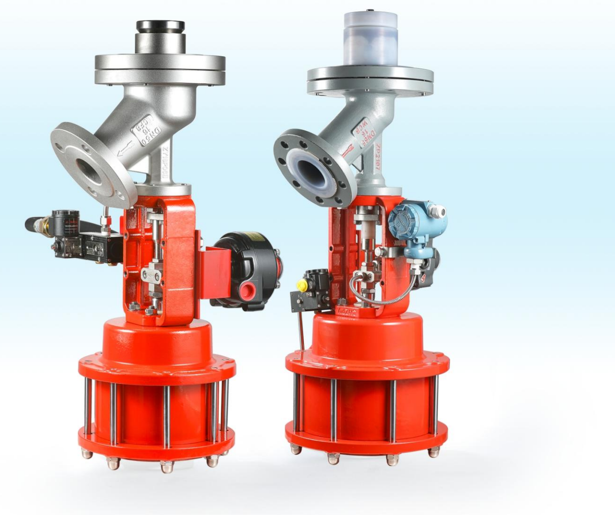
FEP-Lined(Metal) Pneumatic Disc-Rising Tank Bottom Discharge Valve(ZPL180F)