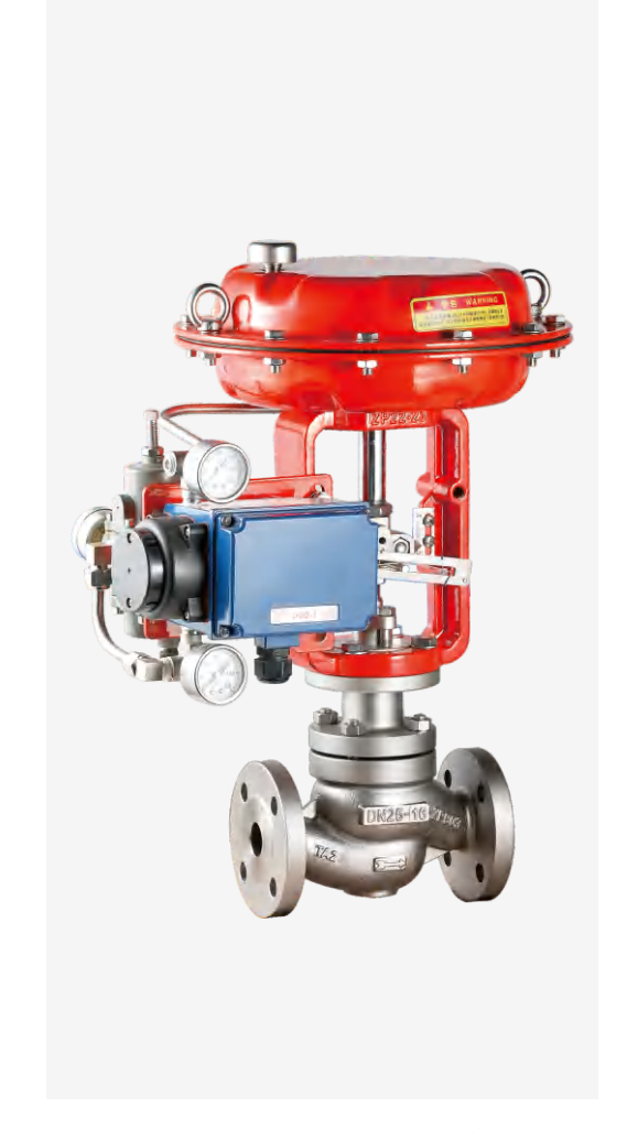
Pneumatic Titanium Alloy Regulating Valve(TA2)