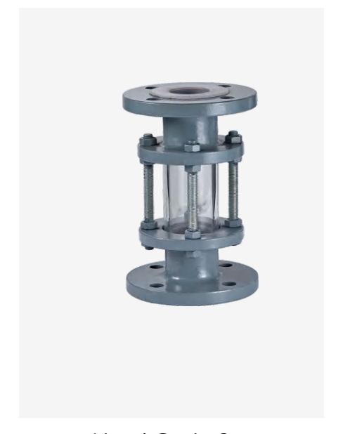
Lined Optic Cup