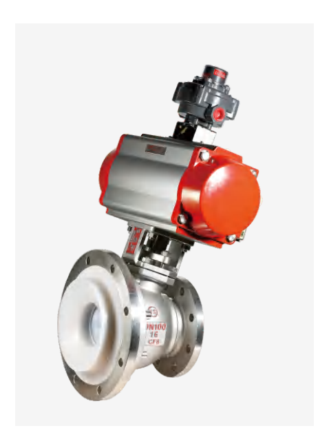
PFA-Lined Pneumatic Inclined Stem Discharge Ball valve(ZPRX740F)