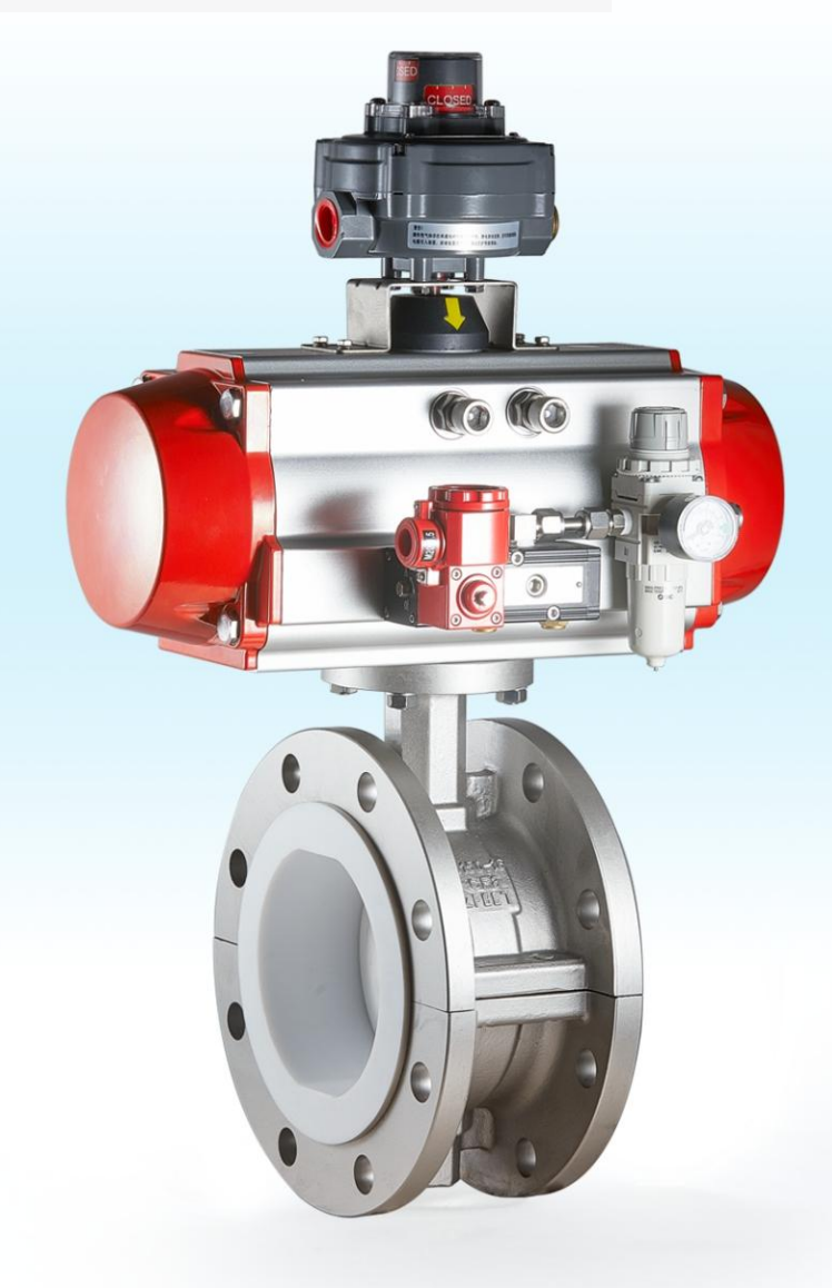
PTFE-Lined Pneumatic Flanged Butterfly Valve (ZPR810F)

Actuator Type: Pneumatic Piston Acting Form: Air Fail To Open(K)