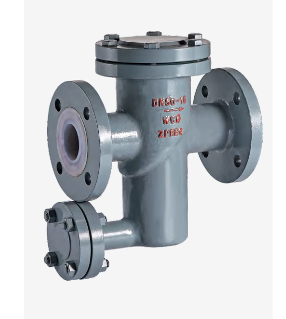
Lined Basket Filter