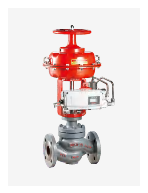
Pneumatic Cage-Guided Single-Seat Regulating Valve (ZPL210Y)