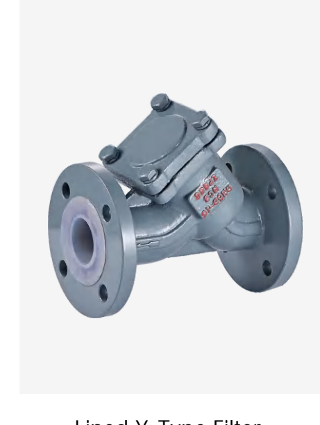
Lined Y-Type Filter