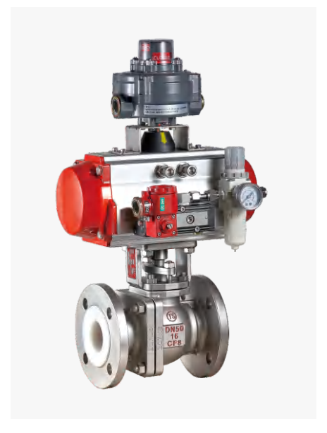
PFA-Lined Pneumatic Shut-Off O-Notched Ball Valve(ZPR710F)