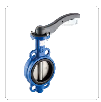
Soft-Sealing Wafer Type Butterfly Valve