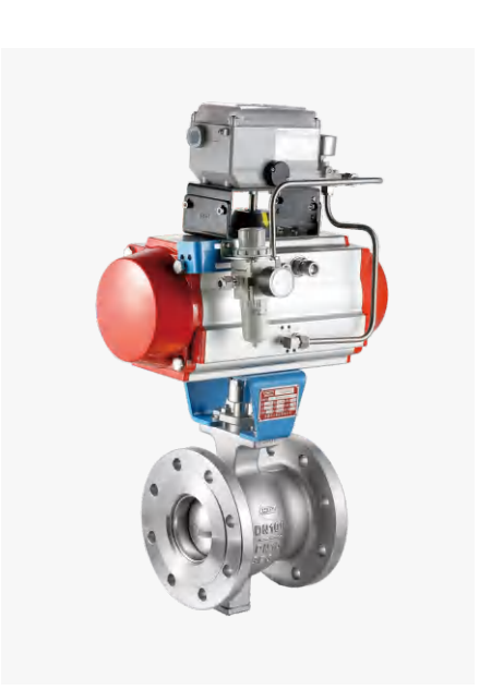
Pneumatic Regulating V-Notched Ball Valve(ZPR760Y)