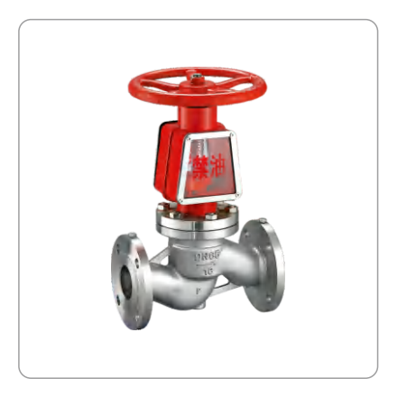
Special valve For Oxygen