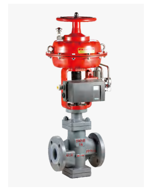
FEP-Lined Pneumatic Bellows Sealing Control Valve(ZPL510WF)