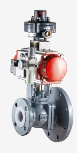
FEP-Lined Pneumatic Vertical Stem Discharge Ball Valve(ZPR740F)