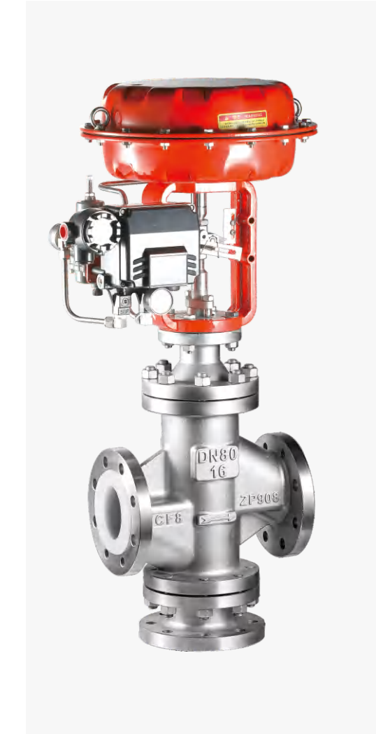
PFA-Lined Pneumatic 3-Way Control Valve(ZPL520F) (Confluence/Diversion)