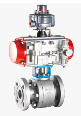
Pneumatic Forged Steel Ball Valve (ZPR750F)