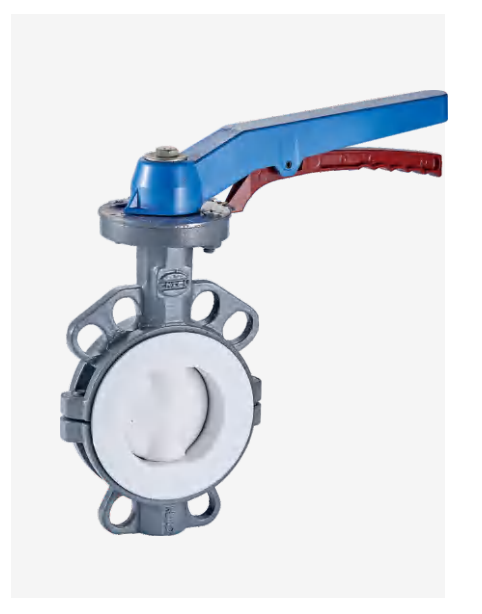
PTFE-Lined Manual Wafer Type Butterfly Valve(F4)