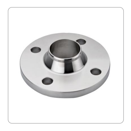
Welding Neck Flange