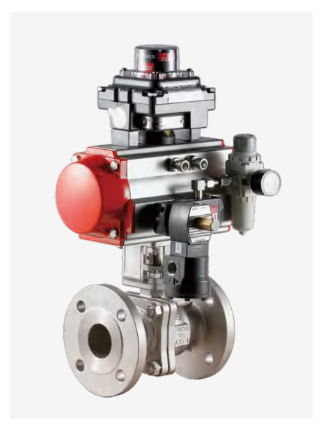
Pneumatic Monel Alloy Shut-Off Valve (M35-1)