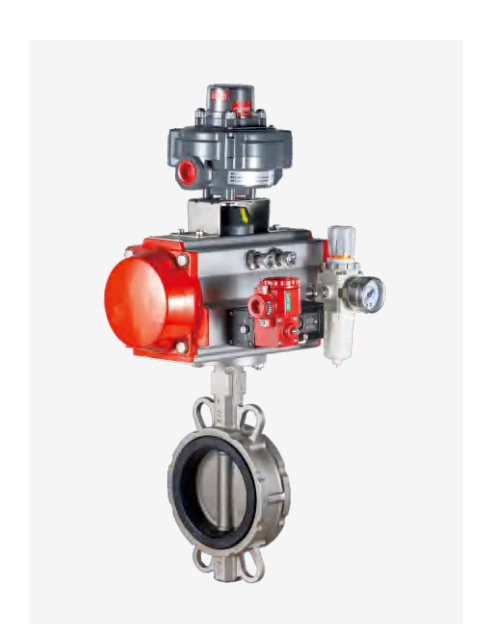
Rubber-Lined Pneumatic Wafer Type Butterfly Valve(ZPR830X)