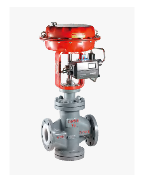
PFA-Lined Pneumatic Single-Seat Control Valve(ZPL510F)