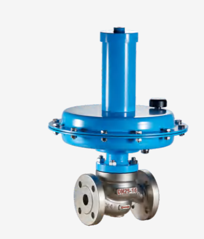
Self-Operated Micro-Pressure Regulator (ZZVP)