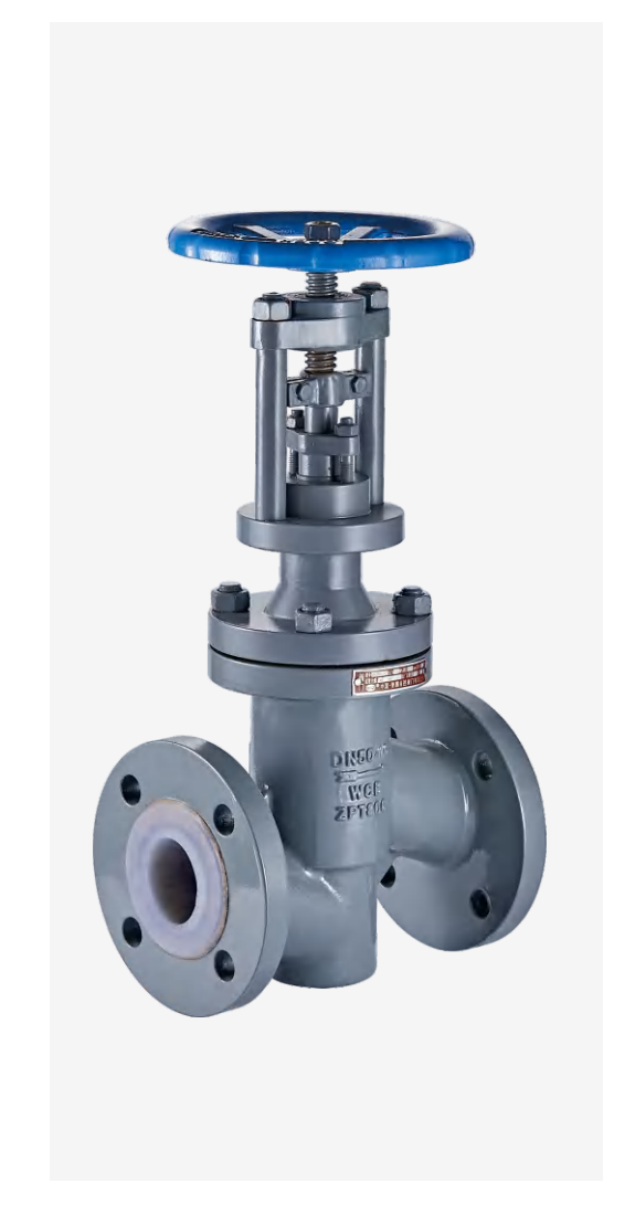
FEP-Lined Bellows Sealing Globe Valve