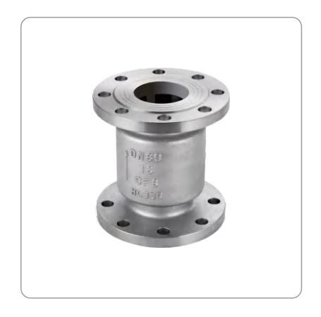
Vertical Lift Check Valve (H42)