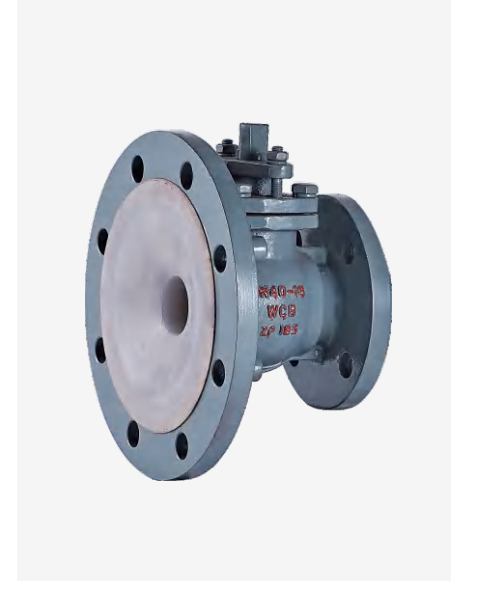
Lined Vertical Stem Discharge Ball Valve