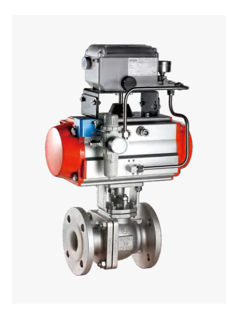
FEP-Lined Pneumatic Regulating V-Notched Ball Valve(ZPR720F)