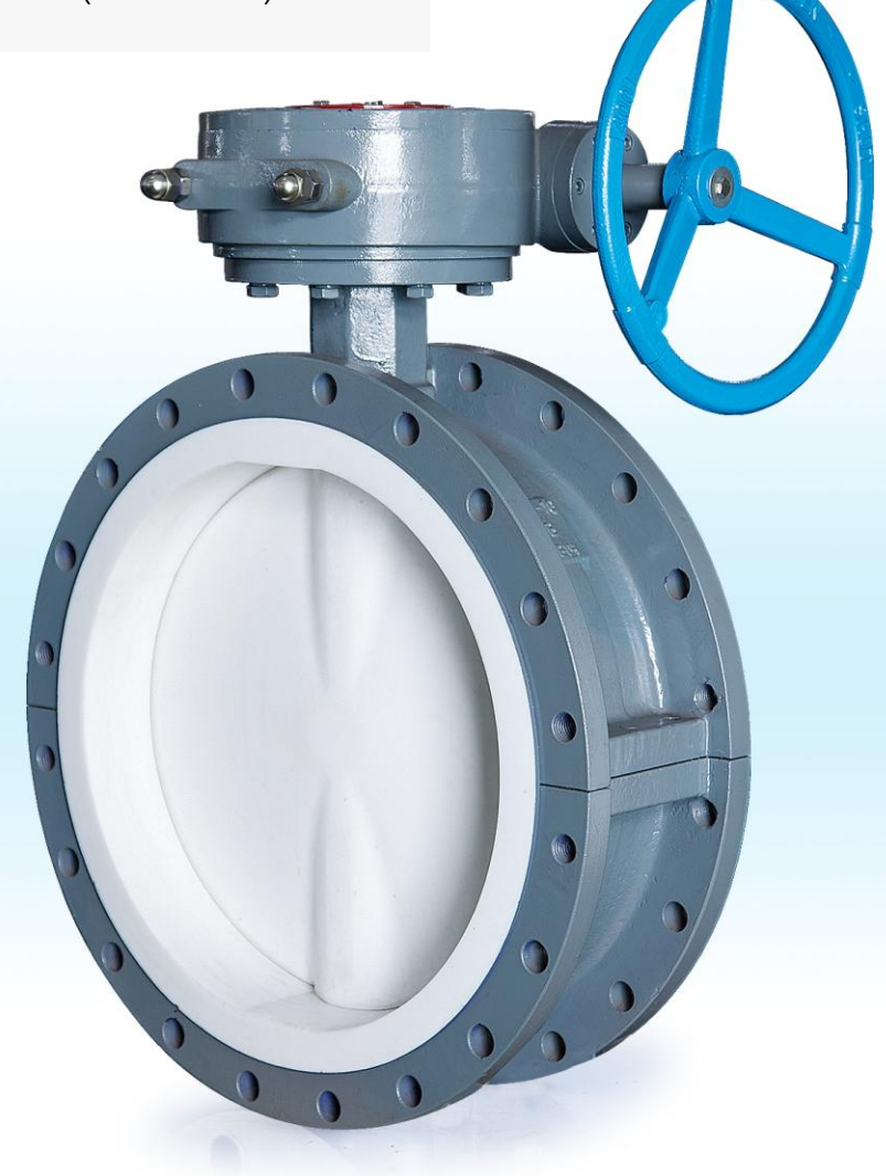
PTFE-Lined Flanged Worm-Geared Butterfly Valve(F4)

Body Material: WCB,CF8,CF3,CF8M,CF3M Lining Material: PTFE(F4),FEP(F46),PFA Temp. Range:-30°C-180°C(-22°F-356°F)