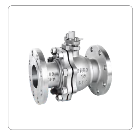
Flanged Ball Valve