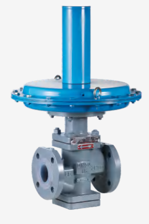
FEP-Lined Self-Operated Micro-Pressure Regulator (ZZVPF)