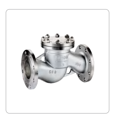
Lift Check Valve (H41)