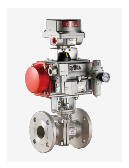
Pneumatic Nickel Alloy Shut-Off Valve (N6)