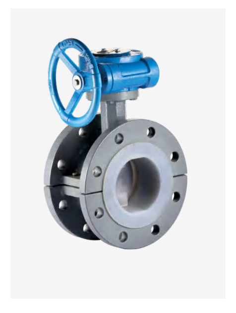
FEP-Lined Turbine Flanged Butterfly Valve (F46)