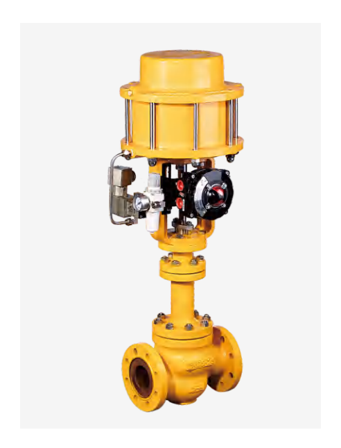
Pneumatic Chlorine Shut-Off Valve(ZPLQ210WF)