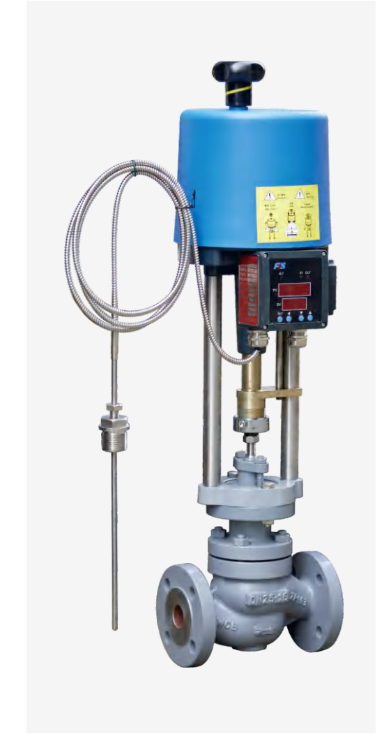
Electronic Temperature-Control Regulating Valve (ZPLD210Y)