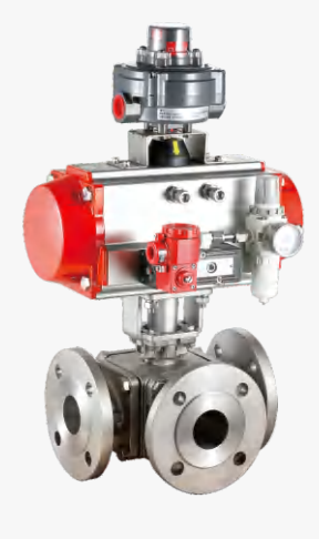
Pneumatic 3-Way Reversing(T/L Path) Ball Valve(ZPR770F)