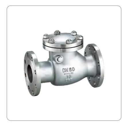
Swing Check Valve (H44)