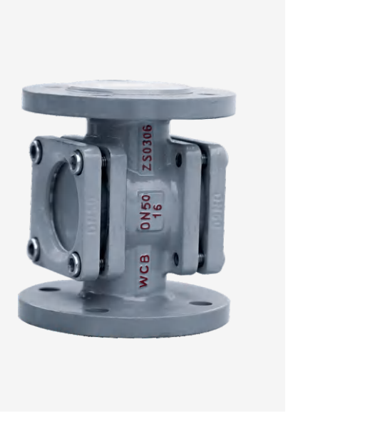
FEP-Lined Sight Glass(F46)