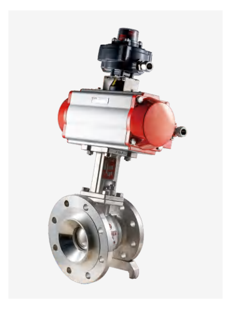
Pneumatic Inclined Stem Discharge Ball valve (ZPRX780F)