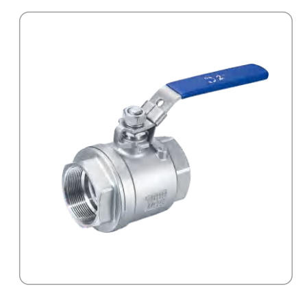
2 pieces Thread Ball Valves