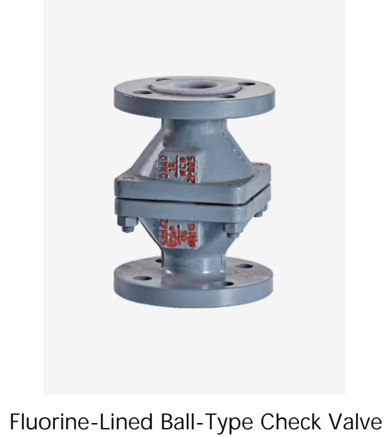
Fluorine-Lined Ball-Type Check Valve (H45)