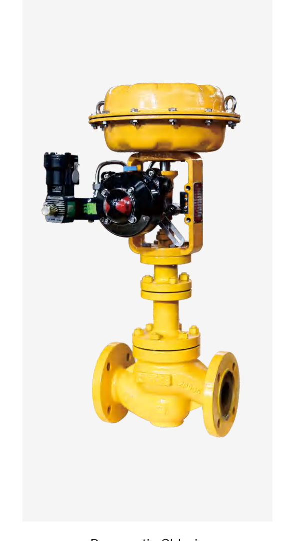
Pneumatic Chlorine Shut-Off Valve(ZPLQ210WF)