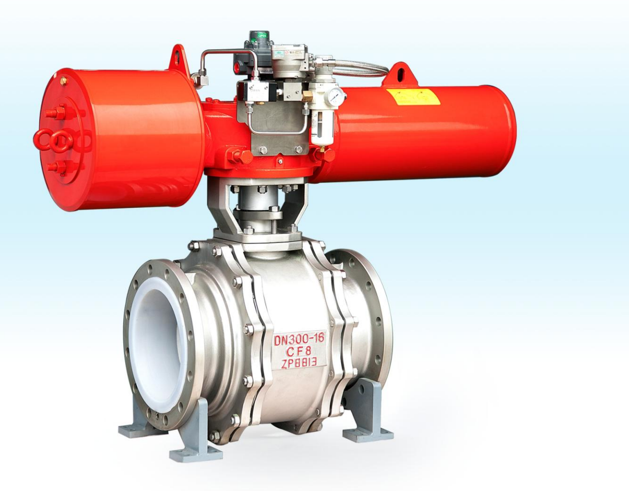
PFA-Lined Pneumatic(Scotch Yoke Type) O-Notched Shut-Off Ball Valve(ZP8813)