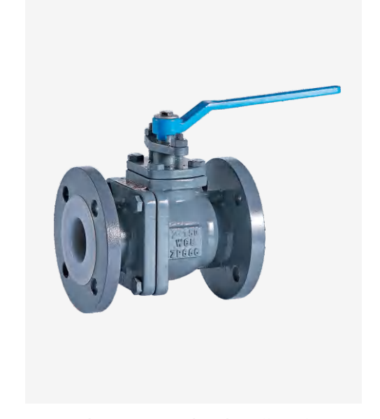
Lined API Standard Ball Valves