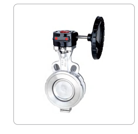
High-Performance Butterfly Valve