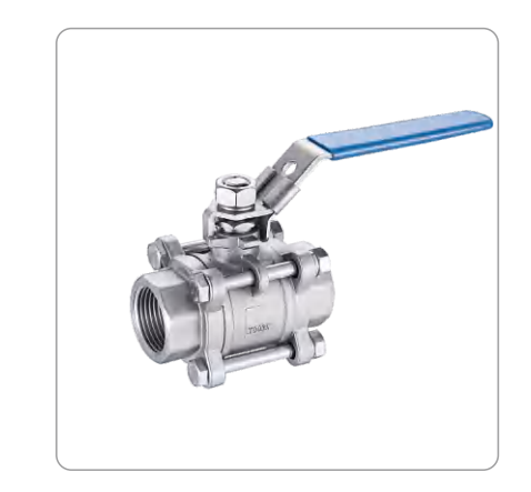
3 pieces Thread Ball Valves