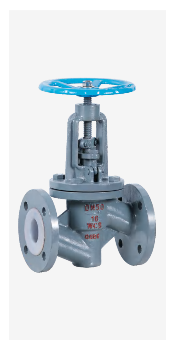
Fluorine-Lined Globe Valve