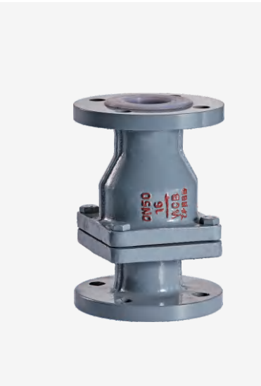
Fluorine-Lined Swing Check Valve (H44)