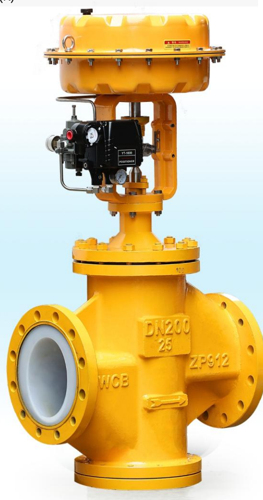
Pneumatic HC Bellows Sealing Chlorine Regulating Valve (ZPL510WF)