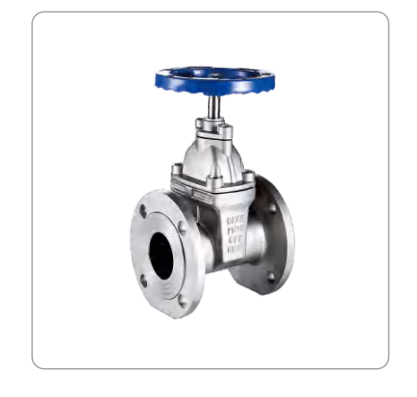
Soft-Sealing Gate Valve