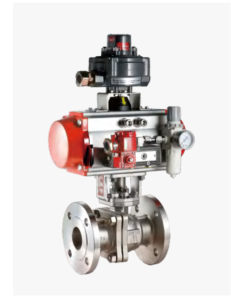
Pneumatic Soft Sealing O-Notched Shut-Off Valve (ZPR750F)