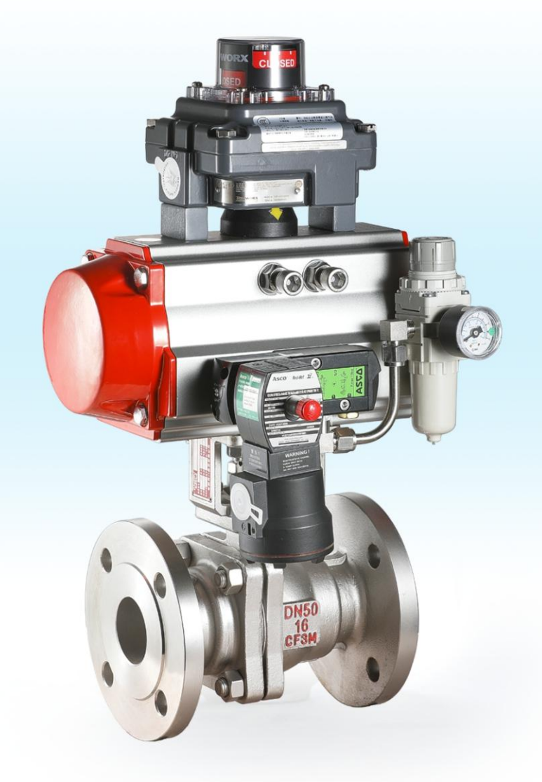
Pneumatic Metal-to-Metal O-Notched Shut-Off Ball Valve (ZPR750Y)