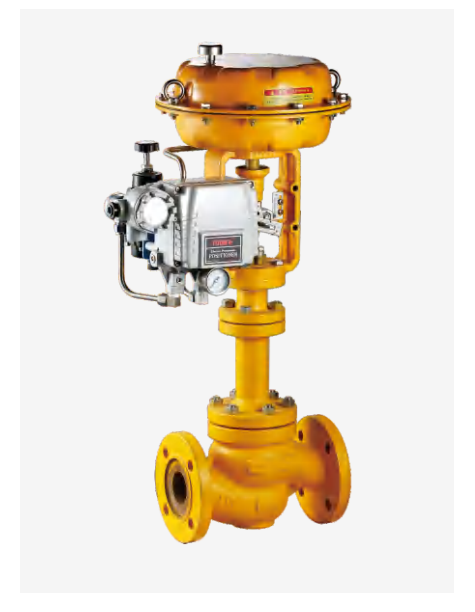
Pneumatic Chlorine Regulating Valve(ZPL210WY)