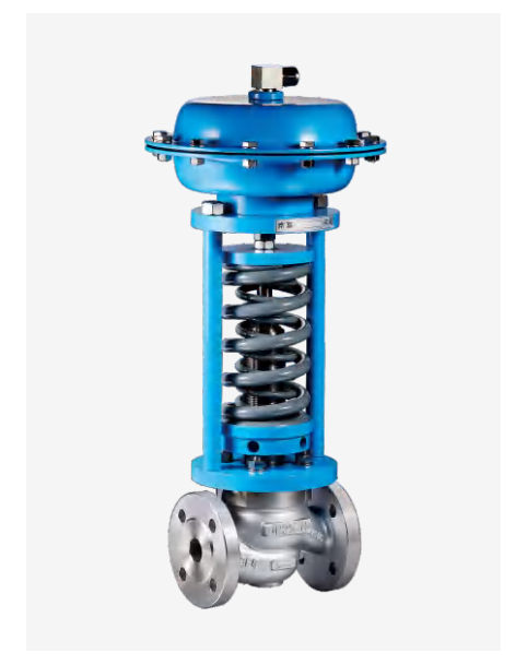
Self-Regulating Control Valve(ZZYP)