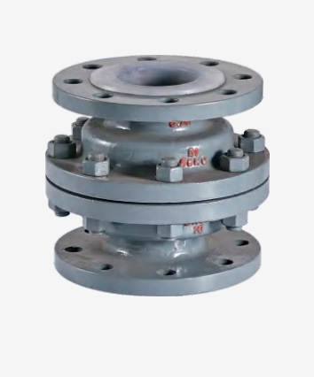
Fluorine-Lined Lift-Type Check Valve (H42)