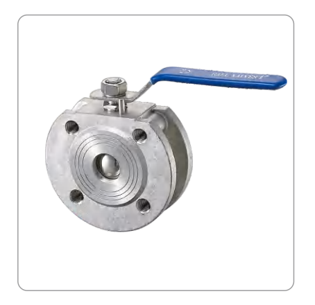
Thin Type Ball Valve