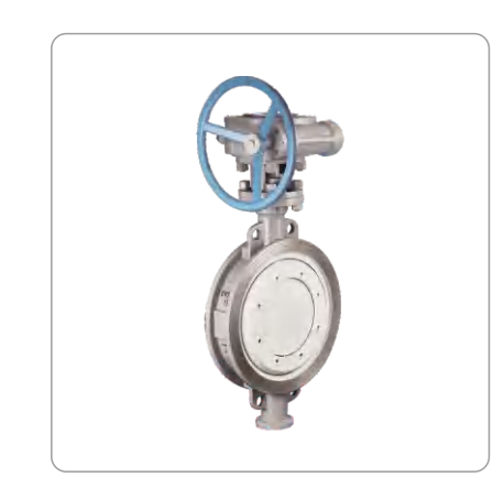
Wafer Type Butterfly Valve