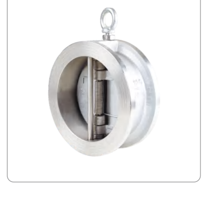
Wafer Type Check Valve(H76)